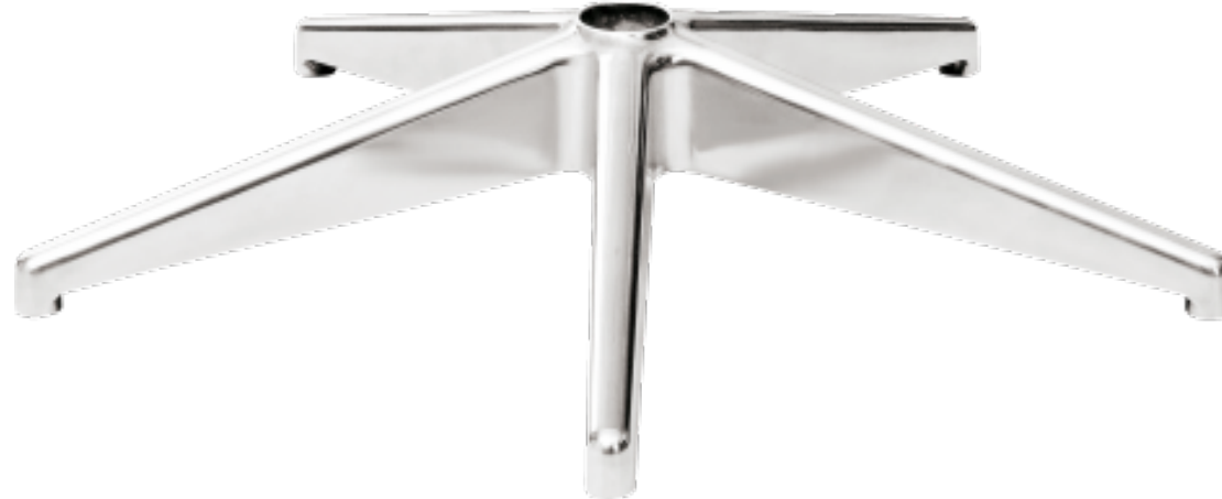
700 mm aluminum base