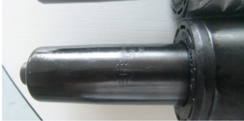
Class 4 gas lift from Samhongsang company

Black piston has surface hardening to become extremely strong