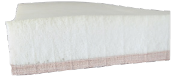
Seat made from mold memory foam