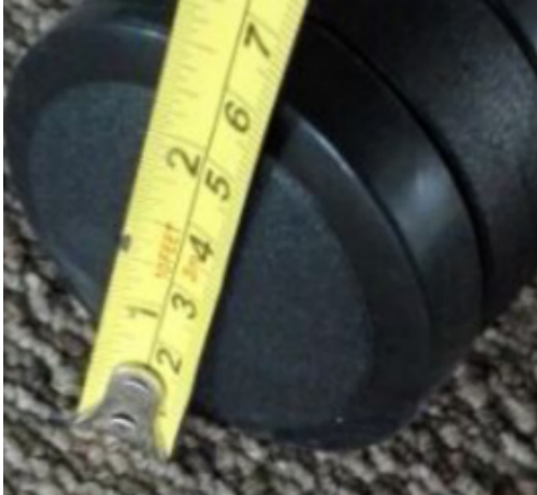
Casters with polyurethane surface \Phi 60 mm.